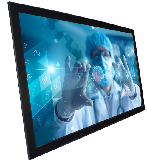
Monitor XTRA-Line 27 front

All figures are typical values. The real values of the panel may vary. The optical characteristics are determined after the panel has been „ON“ for approximately 30 minutes at an ambient temperature of 25° C (77° F).