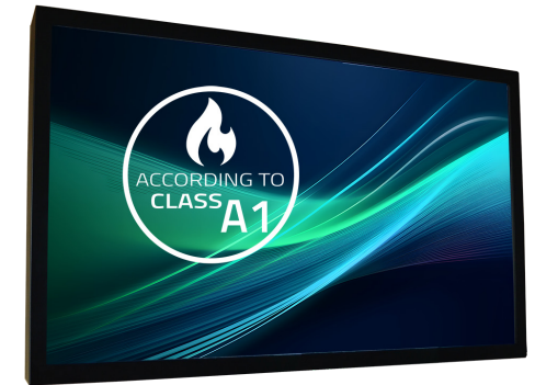
BLO-Line® 4K 54.6 monitor