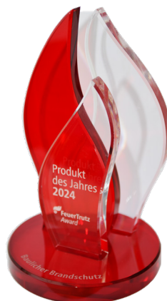
BLO-Line® - PRODUCT OF THE YEAR 2024 Feuertrutz-Award in the category structural fire protection

Fire safety regulations prevent the installation of devices that increase fire load and promote the development of smoke gases. FORTEC Integrated has specifically developed a monitor series that offers optimal fire protection.