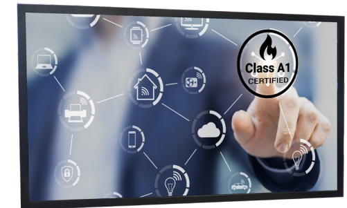
BLO-Line® 4K 54.6 monitor with touch screen

All figures are typical values. The real values of the panel may vary. The optical characteristics are determined after the panel has been „ON“ for approximately 30 minutes at an ambient temperature of 25° C (77° F).