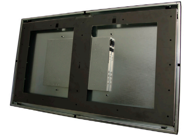
BLO-Line® 4K 54.6 monitor backside incl. wall mount (darker coloured for demonstration)